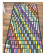
Foreland Fields School Extra Raffle Hand crocheted single bed size throw 90cm (37) x 190cm (75) £1 for 5 tickets. Draw to take place at Christmas Fair at Foreland.

Please come and speak to me in the office or phone me on 01843 268992 if you, or anyone you know, would like to purchase tickets.